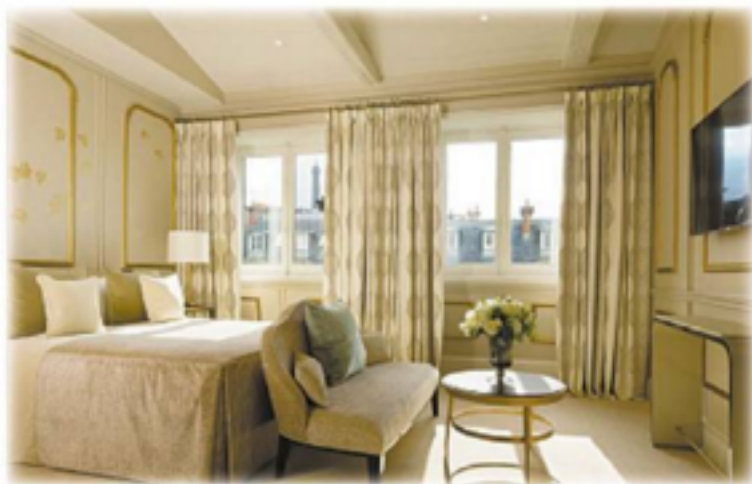
All rooms are furnished with a distinctive, uncluttered classic style in refined colour schemes reflecting an enlightened taste.