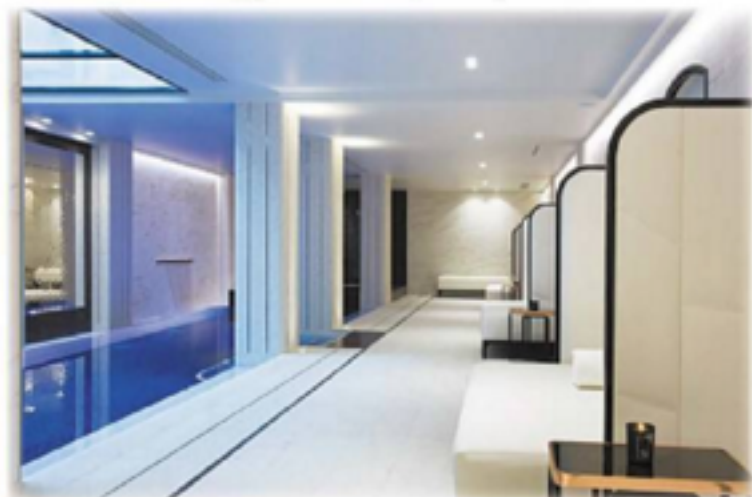
An enchanted spa serves as an inspiration for dreaming up new bathroom designs to take back to people's homes.