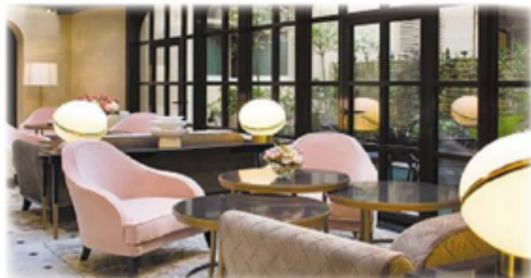
The very best in Parisian lifestyle and philosophy is reflected in the designs at Le Narcisse Blanc hotel-spa located near the Eiffel Tower.